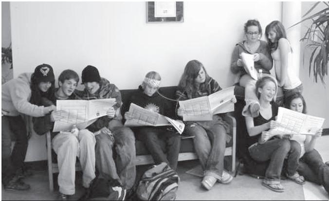
Students ponder the ballot in preparation for voting in the mock election at U-32 November 3 rd .